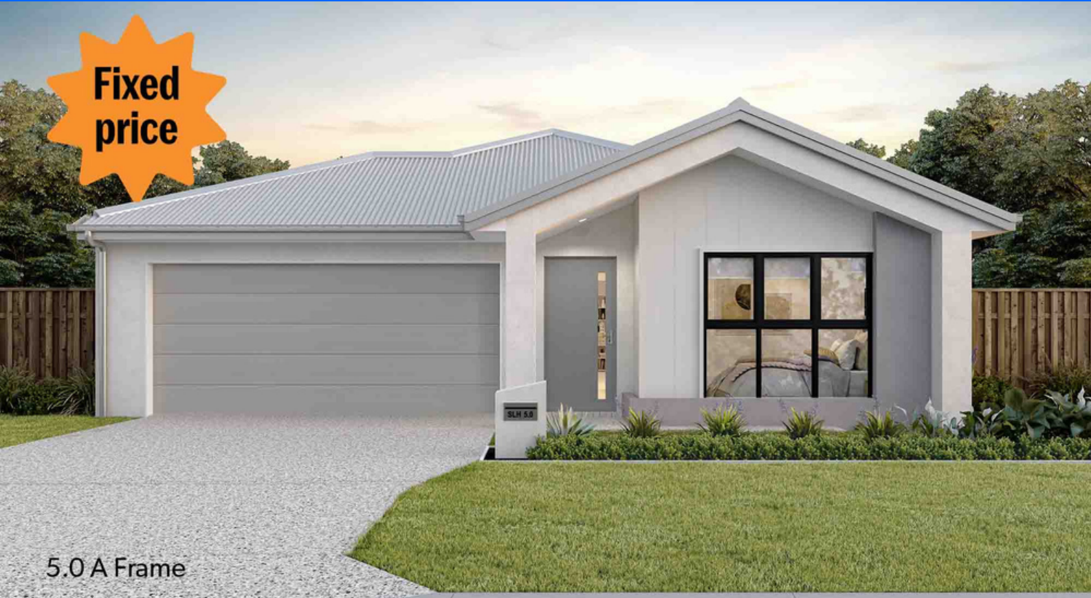
5.0 A Frame